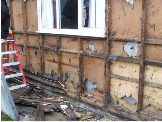
Eastside cladding removed exterior exposed

Over a period of just over 2 weeks the Village Hall was completely transformed.