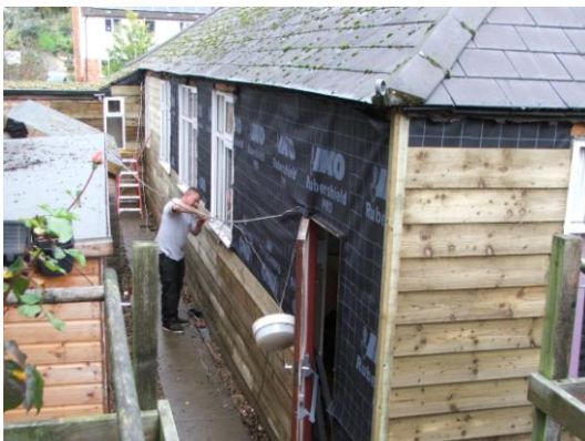
Westside – cladding around window