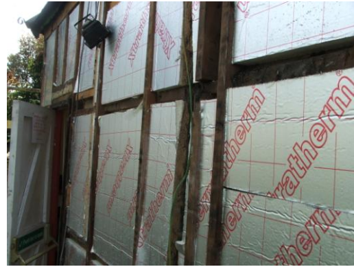
Eastside – new insulation installed