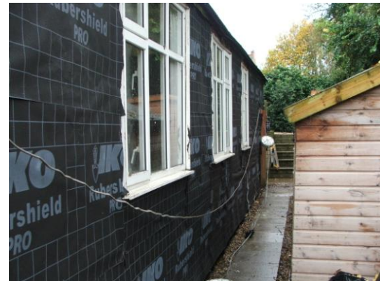
Westside – rubber membrane over insulation