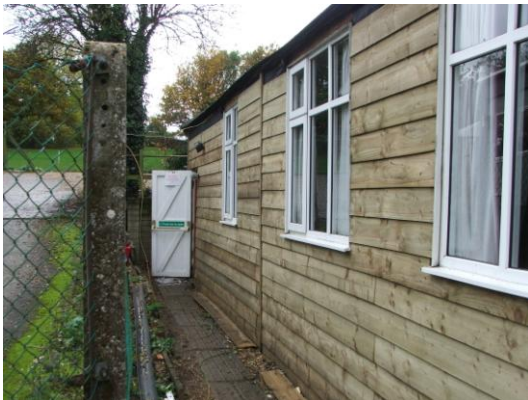
Eastside – cladded to windows