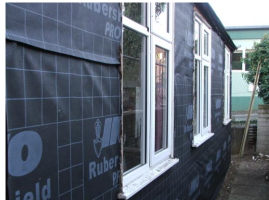
Rear – rubber membrane over insulation