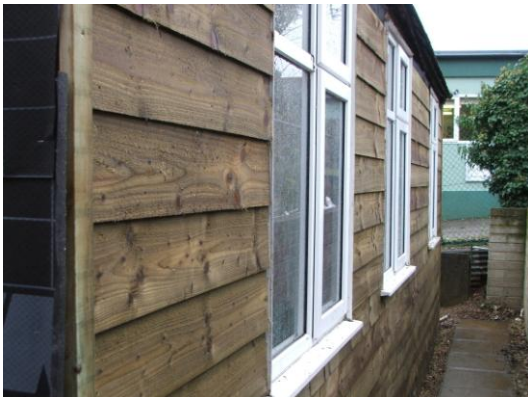
Rear – cladded to top of window